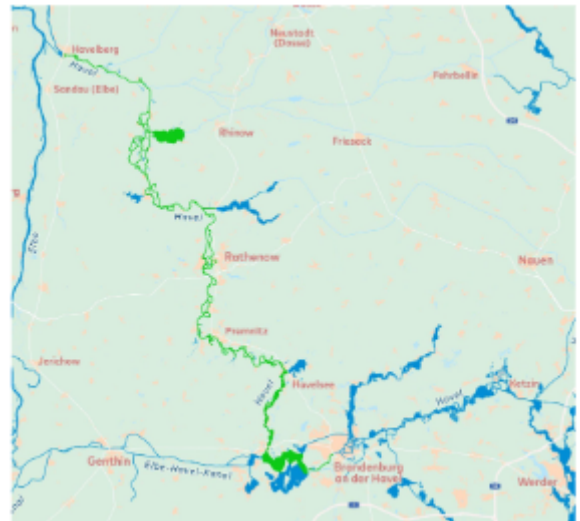
Map 1: Sailing licence-free Brandenburg-Havelberg (click on the map to enlarge)

The practical and theoretical part of the Charterschein is given at the hand-over of the vessel and consists of docking, sailing away, stopping, turning in a narrow space, and so on. A charge will be made for this additional briefing, the Charterschein, as per the current price list.